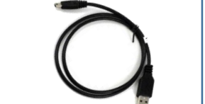
USB interface cable USBMiniLead