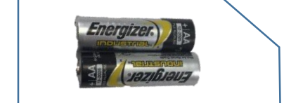
AA batteries AAx2