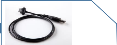
Data USB Download Cable 3150SC