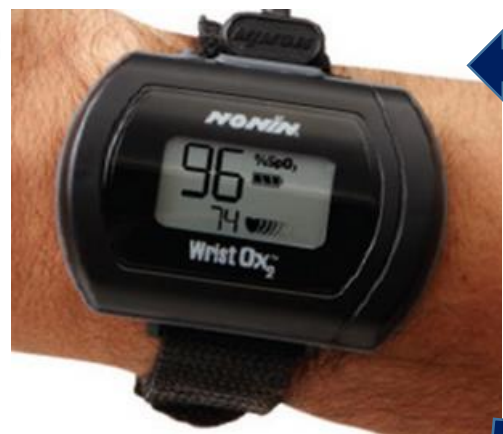
Nonin 3150 WristOx 2 Pulse Oximeter with Memory 3150