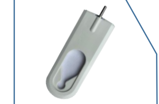
Battery door opener 90011318